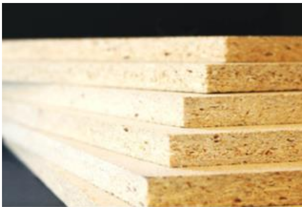
Figure 1 Picture of particle board P2

Product description: The standard particle board, P2, is used for building and furniture and can be used for walls, ceilings and flooring, but also as packaging material.